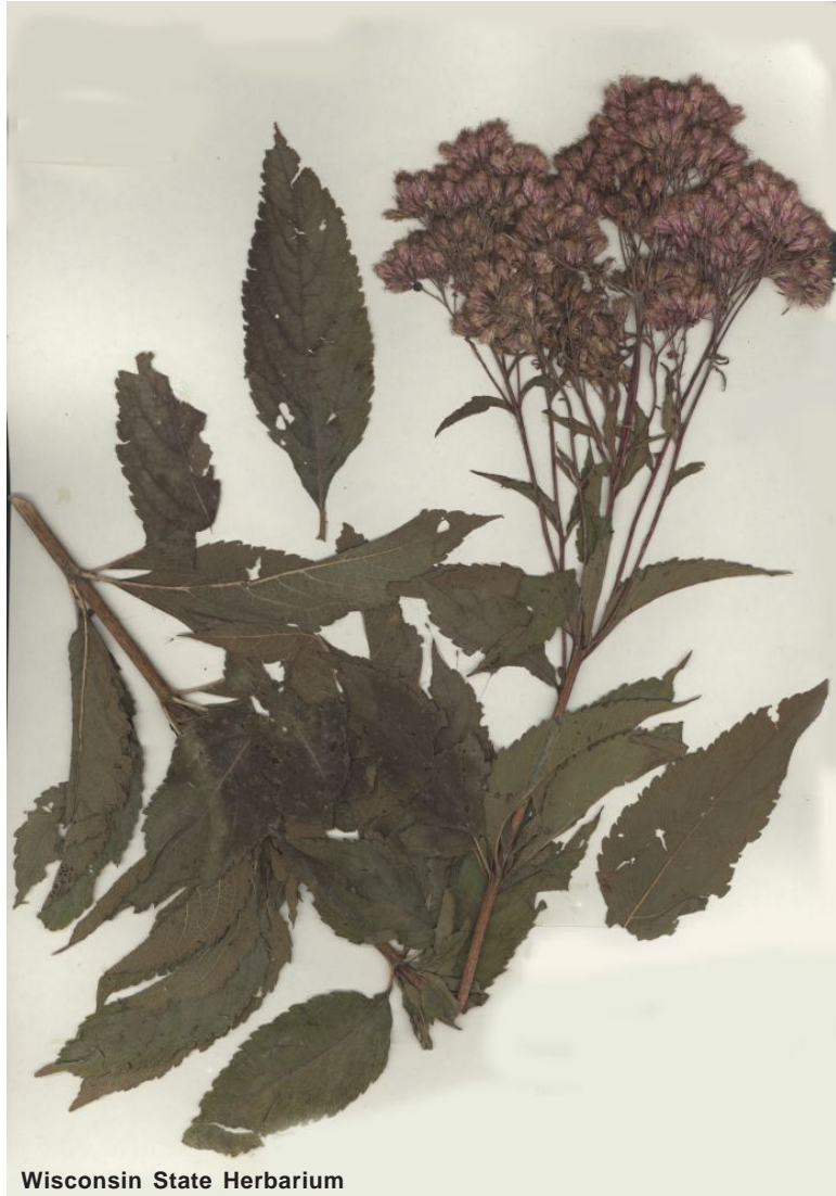
Wisconsin State Herbarium