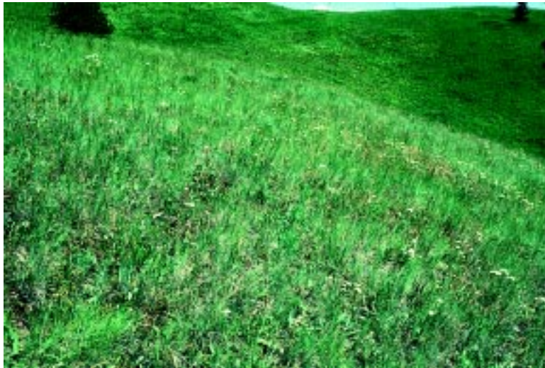
Bob Moseley, Idaho Conservation Data Center

Ecology: C. nitidus prefers sites that are in good ecological condition, i.e., areas that have had only light to moderate or infrequent grazing by domestic livestock. This species appears to be at a competitive disadvantage to annual grasses and other weedy species. The species' response to fire is not known.